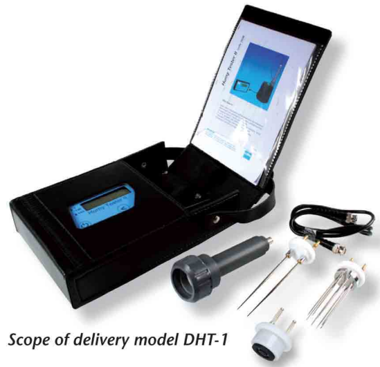
Scope of delivery model DHT-1

** Optional: 1 additional probe 50428M for PVH suppliers (highly recommended)